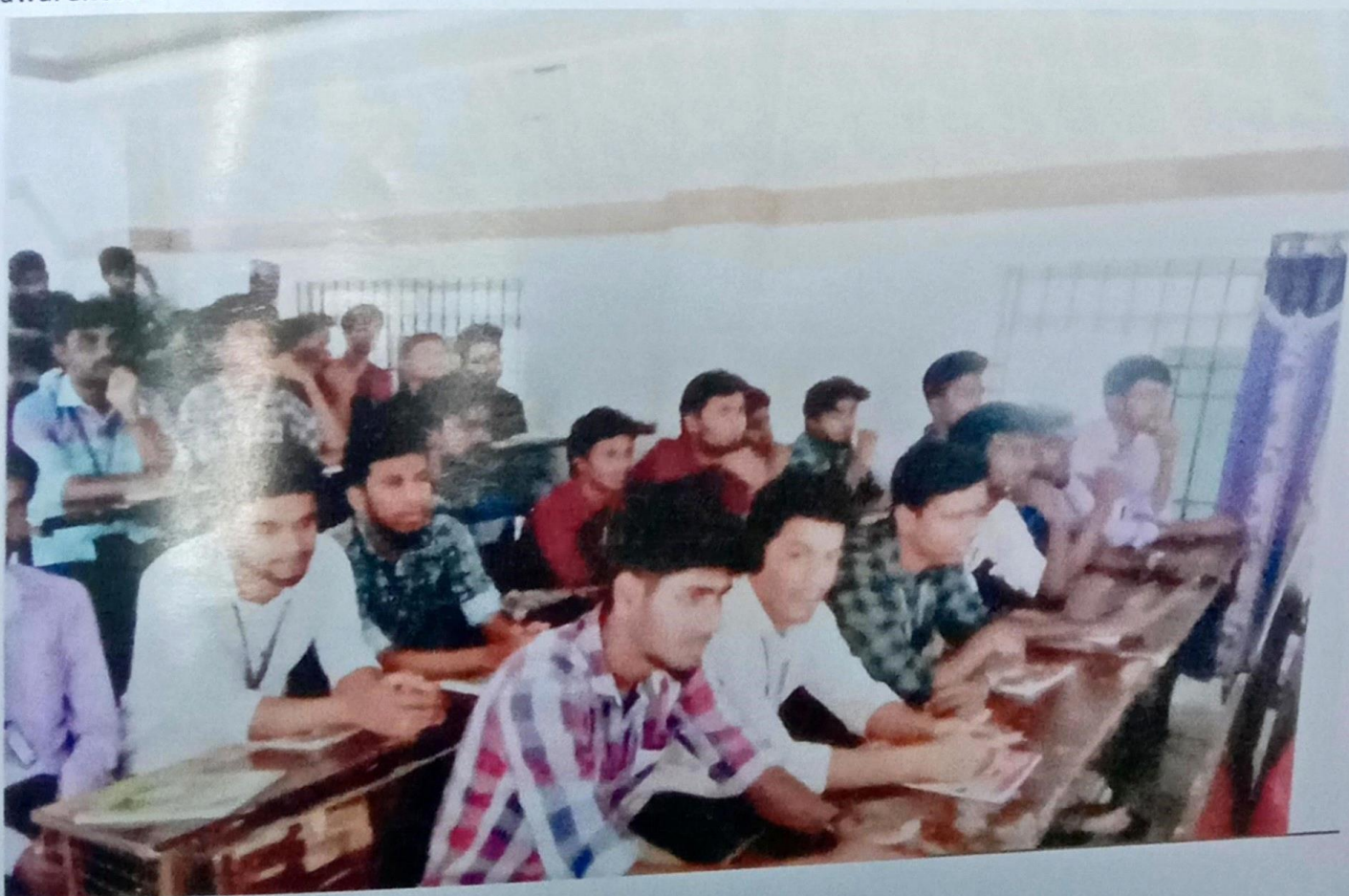
Staff and Students are Participated the program